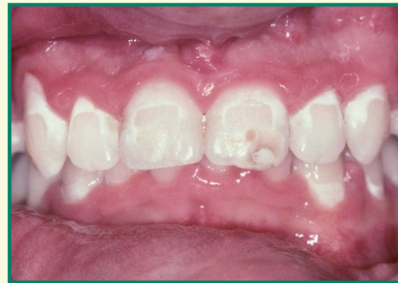
This picture shows the permanent, unsightly marks on teeth caused by poor tooth brushing and eating/drinking habits.